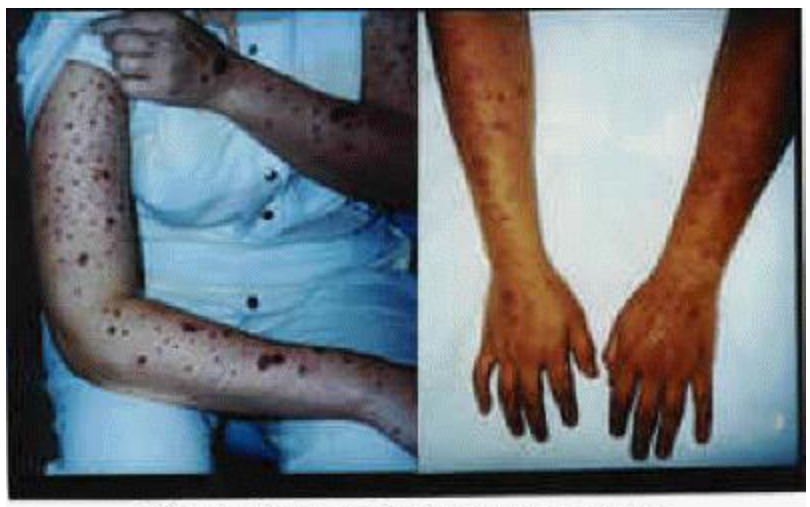
RSD with Skin Ulcers Before and After Treatment

In treating CRPS, even if the opposite extremity looks normal, the treatment should be given to both extremities because of this principle of bilateral innervation.